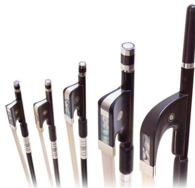
From left to right Violin bow, viola bow, cello bow, French double bass bow, German double bass bow.

If a bow hair snaps , use a small pair of scissors to cut the hair off at the frog and tip. If you try and pull it out all the hairs might fall out!!